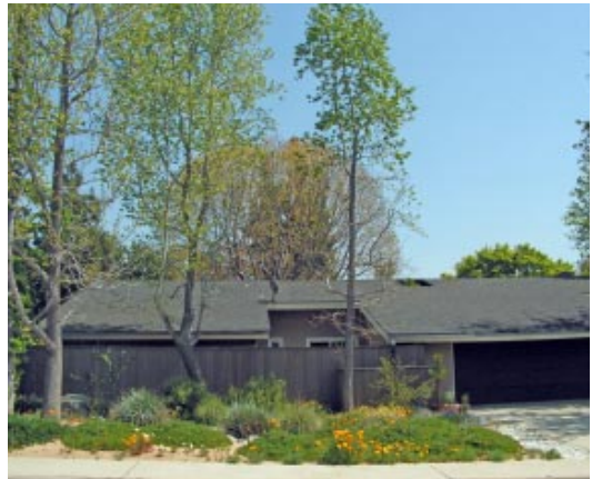
Landscaping Best Management Practices

In the past, the use of California native plants were unfortunately discouraged. The key to using California natives effectively is to choose low-growing varieties of all plants to be used within 20 feet of the structure. Use herbaceous plants, succulents and small