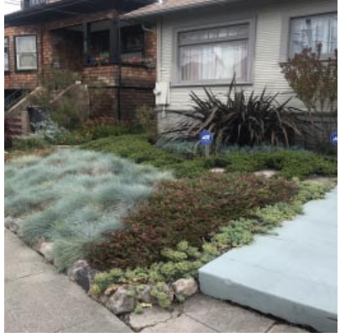
Landscaping Best Management Practices

Focus on mature plant size, form and planting density by type. Here, woody plant elements are broken up with the use of small grasses and high-moisture succulents. Mat forming woody plants, such as the Emerald Carpet Manzanita and Austroflora Fanfare Grevellia are used in small drifts. Remember that even a well-chosen plant palette requires maintenance.