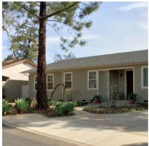
Landscaping Best Management Practices

Even existing pine trees can be maintained to reduce their potential hazard. Meticulous needle removal from the ground, roof and rain gutters is most effective if done every two weeks. Proper watering and pruning to maintain overall health greatly reduces the hazard this pine could present. Never top trees; always seek services from certified arborists for recommendations related to pruning.