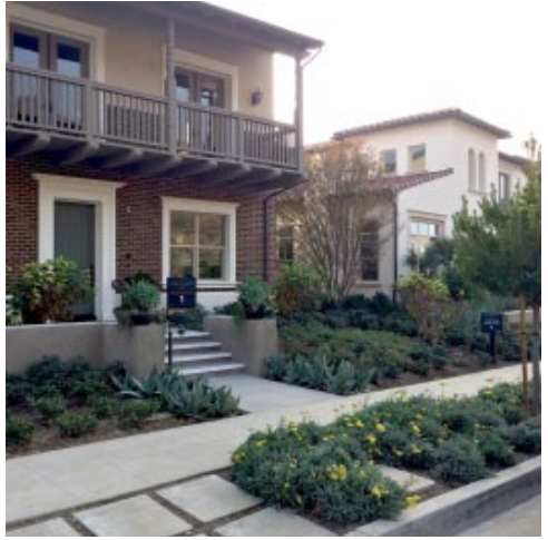
Landscaping Best Management Practices

Choose a palette with predominantly low-growing plants, mixed with succulents and herbaceous ground covers, which are ideal when designing a fire-wise landscape. This minimizes maintenance, such as regular pruning and leaf litter removal. It is best to choose plants that mature to the desired heights rather than using pruning as an alternative. Use small trees (less than 20 feet tall) sparingly as focal points within 20 feet from structures.