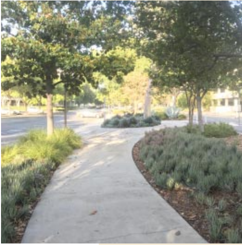
Landscaping Best Management Practices