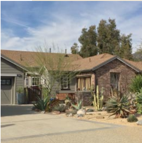
Landscaping Best Management Practices