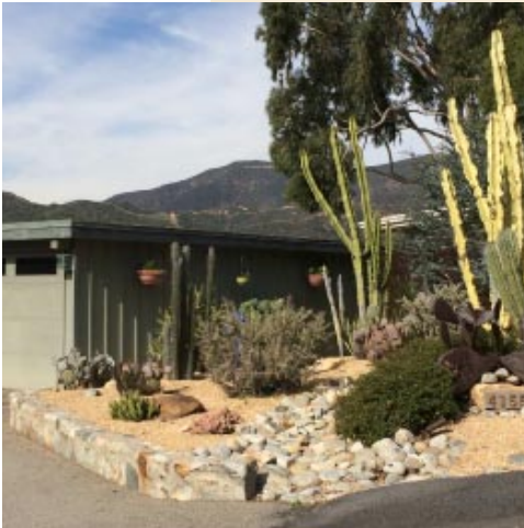
Landscaping Best Management Practices