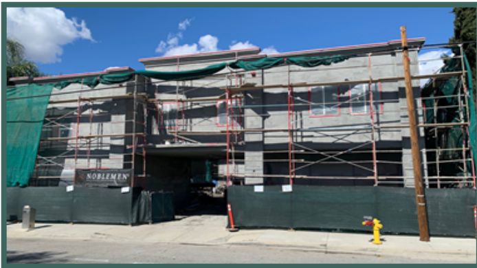
19901 Valley Boulevard Construction Progress

Subsequent to the approval, more mixed-used projects have been proposed in the WVSP area, such as the Lofts at Lemon Creek and Valley Boulevard. City staff is currently processing a number of applications for new development along Valley Boulevard and the West Valley corridor will continue its transformation through quality development and strict design guidelines.