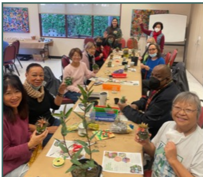
Residents at the succulent workshop

Last month, the Walnut Valley Water District presented a Succulent and Drought Tolerant Landscaping Workshop. 30 members of our senior community enjoyed arranging their own plant to take home, all while learning the benefits of drought tolerant landscaping.