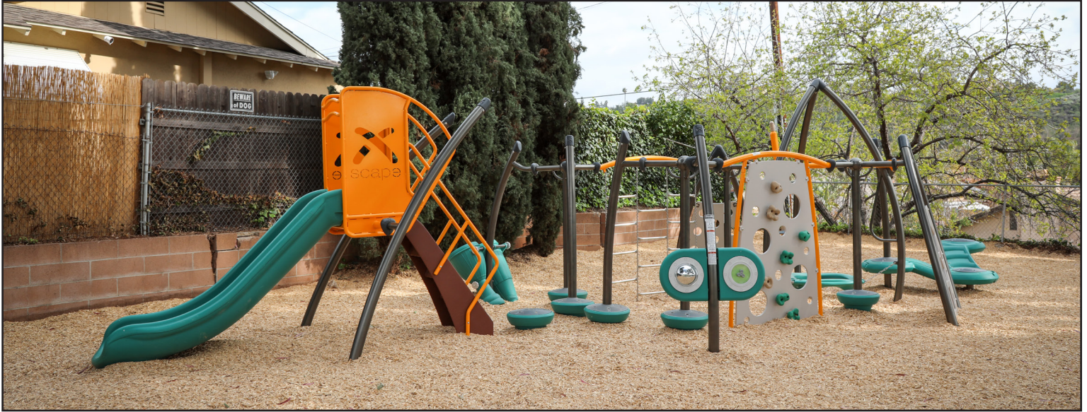
New playground equipment at Heidelberg Park

The installation of the new playground at Heidelberg Park has been completed. A playground safety audit is scheduled and the goal is to have the playground/park re-open for the community's enjoyment by the end of next week.