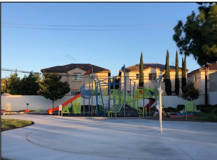
Construction progress at Ashley Park

All concrete work has been completed on the basketball court and the park pathways. The playground equipment is being installed this week and the contractor is preparing the site for park finishings including a new barbeque, picnic benches under the gazebo, and new benches throughout the park. The concrete on the basketball court is currently in the 28 day curing period prior to painting surfacing colors and all markings. Staff is working with the installing contractor to obtain a final completion date, which will be soon!