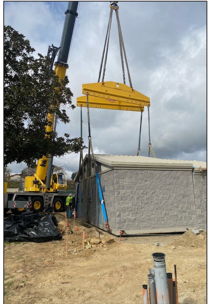
Creekside Park Restroom/Storage Building