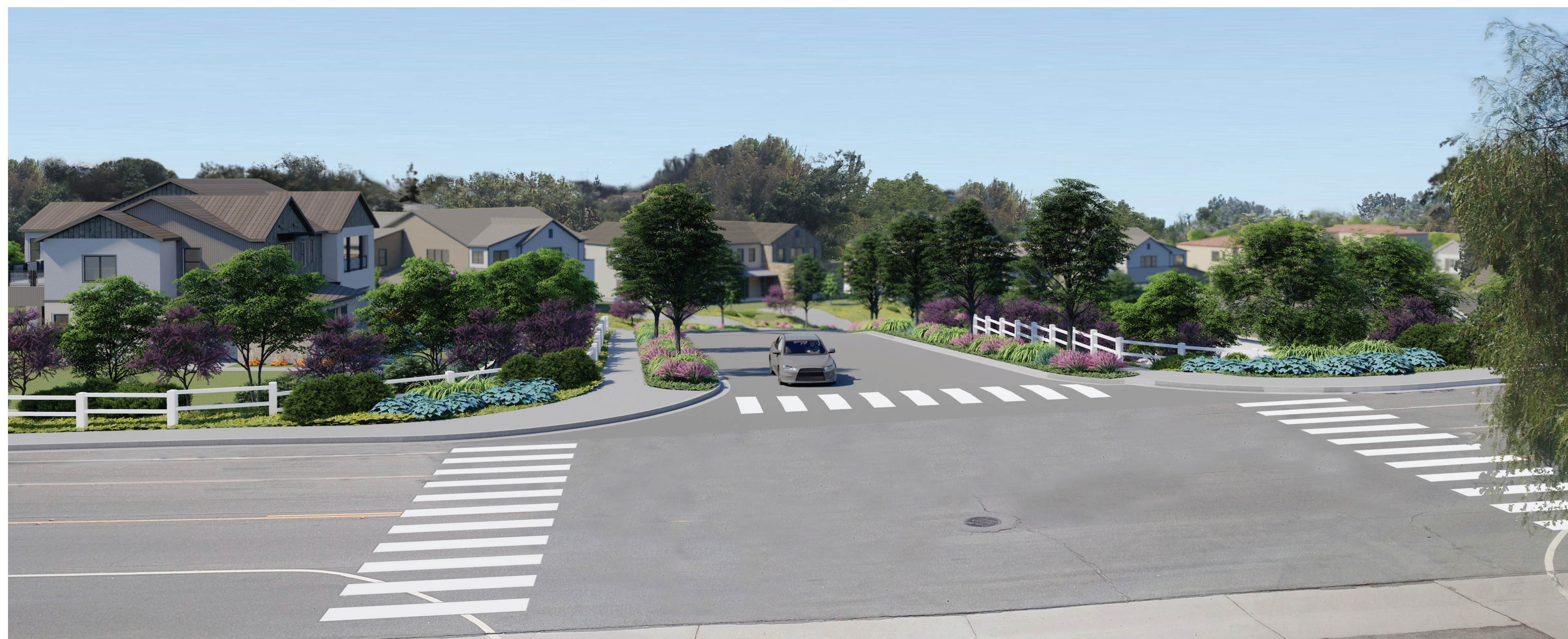
PROPOSED CONDITIONS: 2-3 YEARS