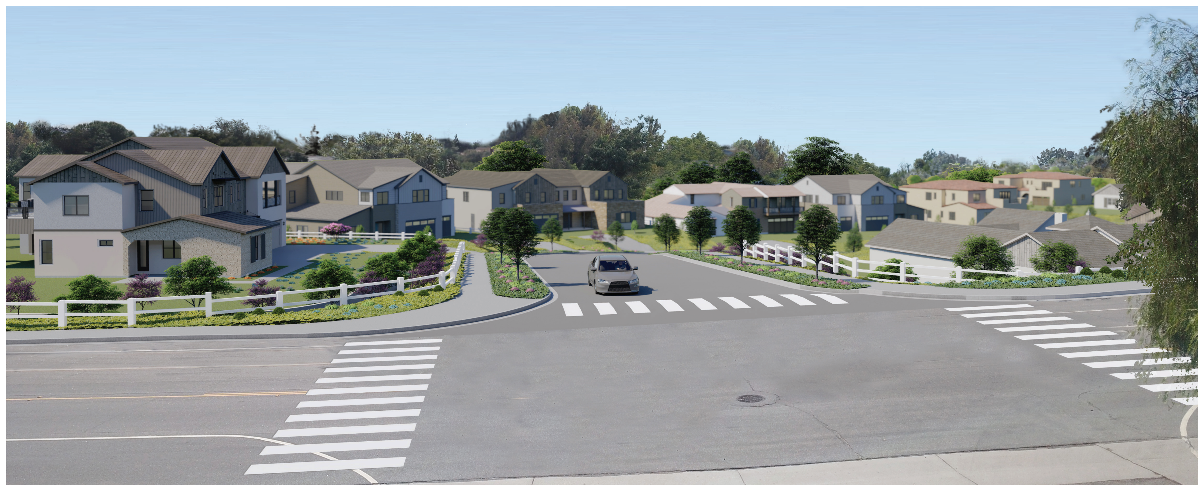
PROPOSED CONDITIONS: DAY 1