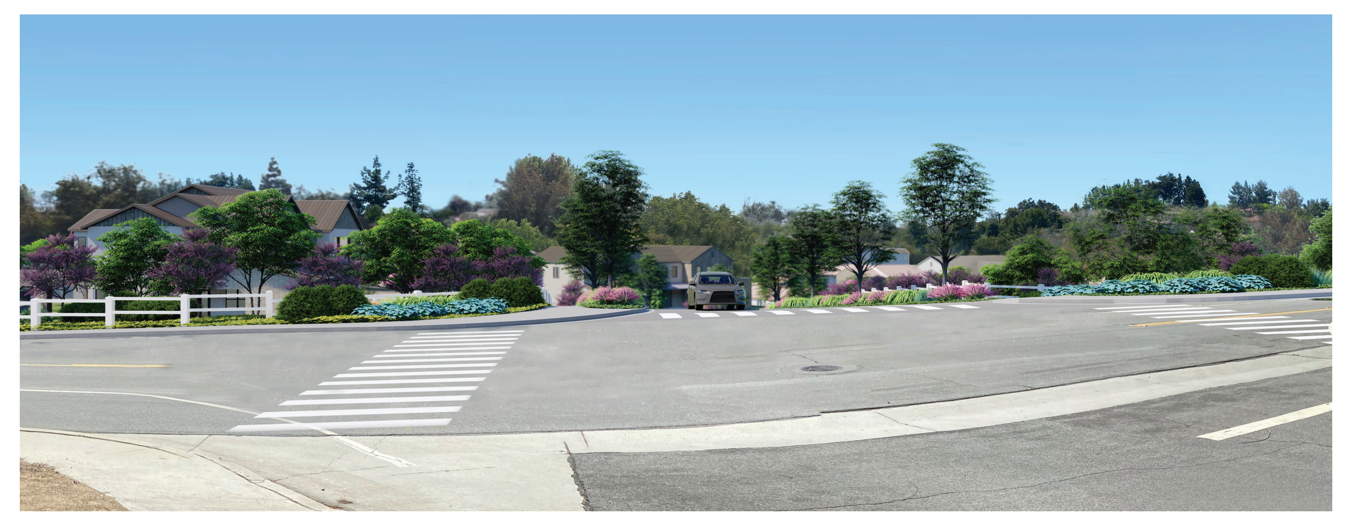
PROPOSED CONDITIONS: 2-3 YEARS