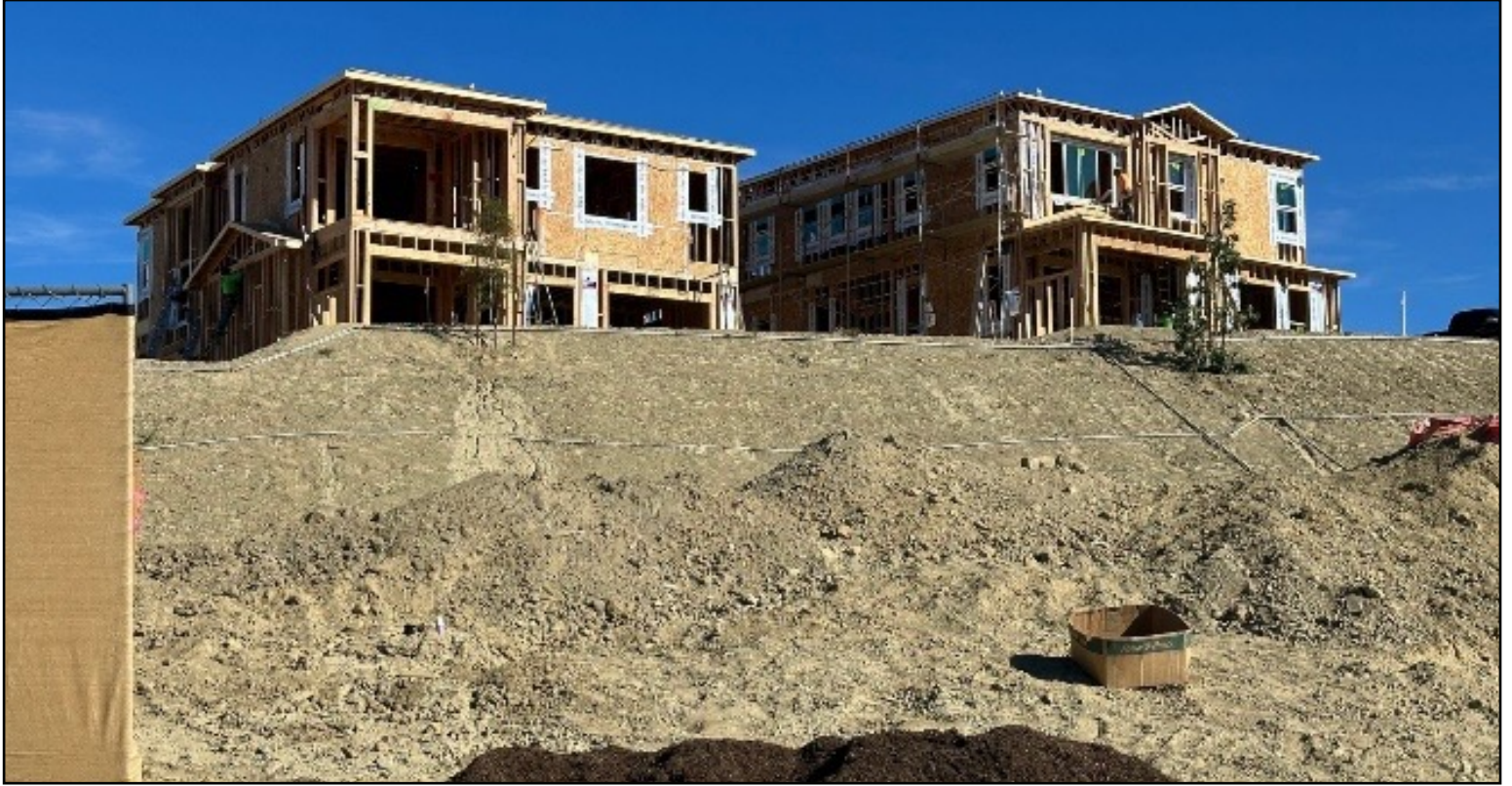
Construction of model homes at the Terraces at Walnut

The Terraces at Walnut (49 Acres Site) on Valley Boulevard has seen some recent major updates. The construction of model homes has begun - currently in the framing phase. Many of the home foundations are also being worked on with an estimated timeline to open models being late Spring 2024. This Project will bring a variety of home options (290 total homes), including townhomes, small-lot detached homes, and large-lot configurations. The 20,000 square-feet of commercial food/retail space is also being constructed concurrently with the homes. Community Development is working closely with the developer to ensure the commercial space is filled with a diverse mix of food/retail uses that will be complimentary to the Community.