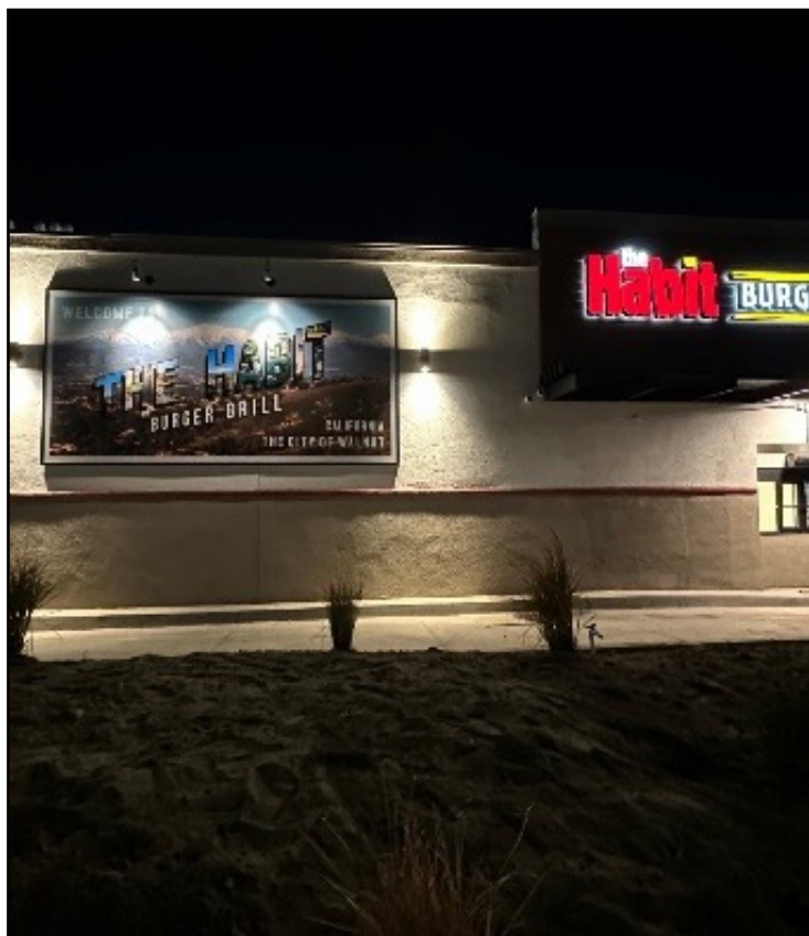
The Habit Burger Grill opening soon in Walnut

The Habit Burger Grill is set to open January 1st in the MT. SAC Center (former Jack in the Box location). Community Development worked closely with The Habit to ensure this location included an enhanced architectural design and one-off aesthetics to meet community expectations for high quality development and uses within the City. The final design includes unique features, such as a mural on the building façade facing Grand Avenue with images taken from City scenery and inset into the letters/ backdrop of the mural. The building also includes enhanced lighting, building signs with Halo illumination, an outdoor patio with string lights and heaters for an enhanced ambience, and complimentary landscaping.