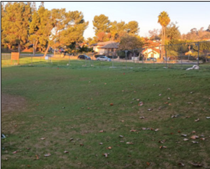
Grass growing back at Creekside Park

Hydro-seeding for the Diversity Plaza Creekside Park project was successfully completed two weeks ago, resulting in promising germination observed this week - the beautiful green grass at Creekside Park is returning. Large electrical equipment needed to provide proper power was ordered 14 months ago and is still pending due to supply chain delays. As soon as this equipment arrives, required final inspections from LA County can be completed and Edison can also finalize their requirements. Finishing work is progressing inside the mechanical room and around the project site. With the recent removal of the panels along the fencing, residents have an ability to get a sneak peek at the plaza and all the improvements.