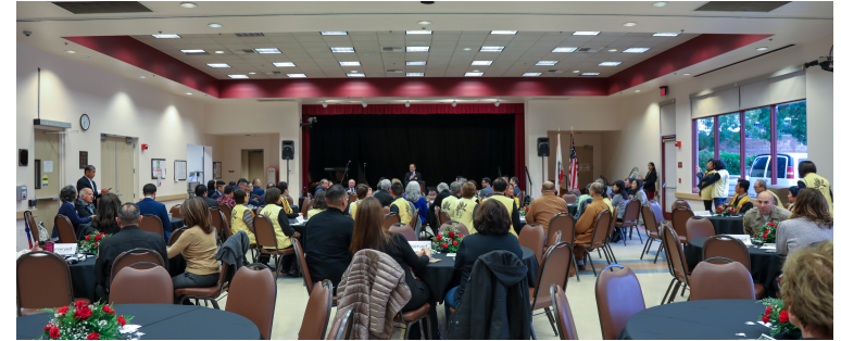
Attendees at the 2023 Mayor's Prayer Breakfast

The Annual Mayor's Prayer Breakfast is scheduled on May 2nd, 2024 (National Day of Prayer), from 7:30 AM to 9:00 AM at the Walnut Senior Center. Staff is in the beginning phases of planning the Event, so be sure to keep an eye out (likely in February) for the event flyer and additional information on how to RSVP.