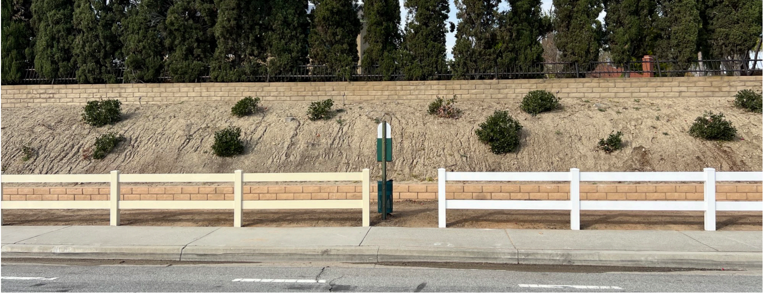
Walnut Trail Fencing Sample

The City of Walnut is seeking public input on the potential replacement of the post and rail throughout the City to a vinyl product. A sampling of the two colors (white and almond) is installed on La Puente Road at Old Post. Additional information is available on the City's website ( here ), including a survey where residents can submit their feedback to the proposed improvements. As the Council is aware, the existing wooden post and rail has become obsolete due to several factors, including safety (vehicles), chemicals that are no longer available to treat the wood, and rising costs of maintenance. Staff will be providing more information via social media to make sure the public is informed as to why options for the City's trail fencing is being explored. Survey link: https://forms.office.com/r/Yh6wtaTgTH