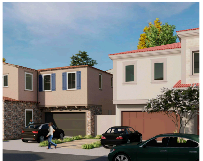
Artist renderings of model homes

The Terraces (49 Acres) Residential/Commercial Project is ahead of schedule and is estimated to have model homes open in early March. There has been an immense amount of interest in this Project, which will offer 290 new homes and over 15,000 square-feet of commercial restaurant/retail space. The Developer has indicated that sales for the first few phases of the single-family detached homes is strong. The City's Economic Development Team is working close with the developer to recruit a diverse set of eateries and other commercial establishments that will be complimentary to the Community and offer new places for Walnut residents to eat and shop. More information on the new business that will be coming to the Community will be shared in the coming months.