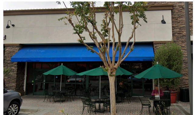
Previous Rubio's location

City staff continues to work closely with the property owner of Snow Creek Village West to find a tenant for the former Rubio's location. The public is encouraged to contact City Staff to inform of businesses that they would like to see come to the City so that Staff may narrow the search to businesses that are desired by the Community. The public may contact Planning/Economic Development by calling City Hall at 909-595-7543 to submit thoughts on the type of businesses that should come to Walnut.