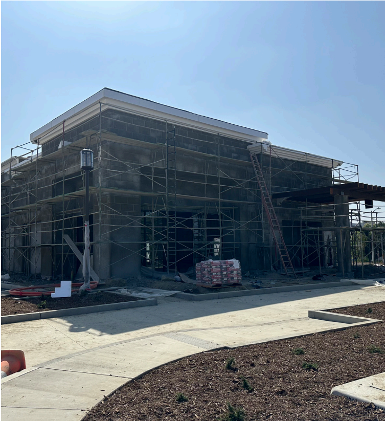
Building Shells for Commercial Component

Interest in The Terraces Project continues to remain strong. Progress continues to be made daily on new phases for the two (2) story small-lot single-family and townhome products. Models for the townhomes are also nearing completion, which will be completed and open to the public in early July. Construction of small-lot residential product is expected to begin in August/September. The building shells for the commercial component are expected to be completed in early July, at which point future tenants will have the opportunity to begin their work. Jersey Mike's and The Great Greek are confirmed eateries that will be coming to the project. Work continues to search for a compatible restaurant that will be complementary to the Community and surrounding uses.