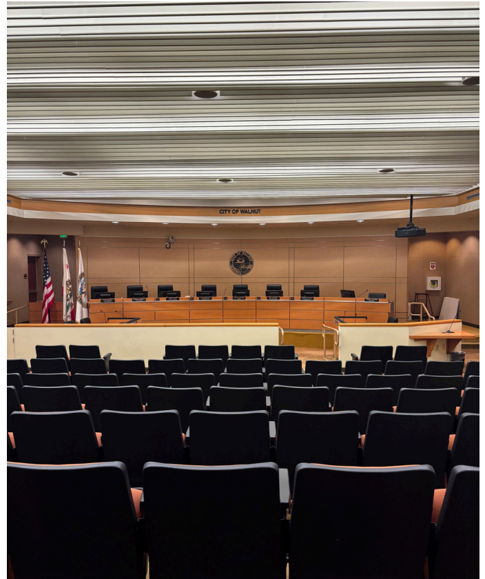
Walnut City Council Chambers

Please contact the City Clerk's Office at (909-348-0710) or email tdedios@cityofwalnut.org if you have any election questions.