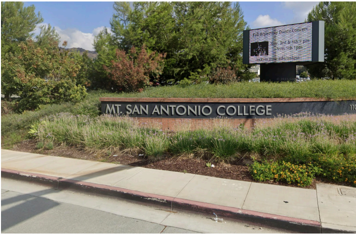
Mt. SAC Campus Signage

On May 15, 2024, the LA County Sheriff's Department (LASD) sent Mt. SAC Administration a draft MOU for their review. Staff also forwarded a written request that the current MOU should be terminated, pursuant to the required thirty (30) day written notification via either party. Once an updated MOU is agreed upon, Walnut Station Deputies will still respond to mutual aid requests and other serious Part-1 crimes. However, the more routine incidents will be handled by Mt. SAC, which will help increase response times and keep deputies available to serve all areas of the City more efficiently.