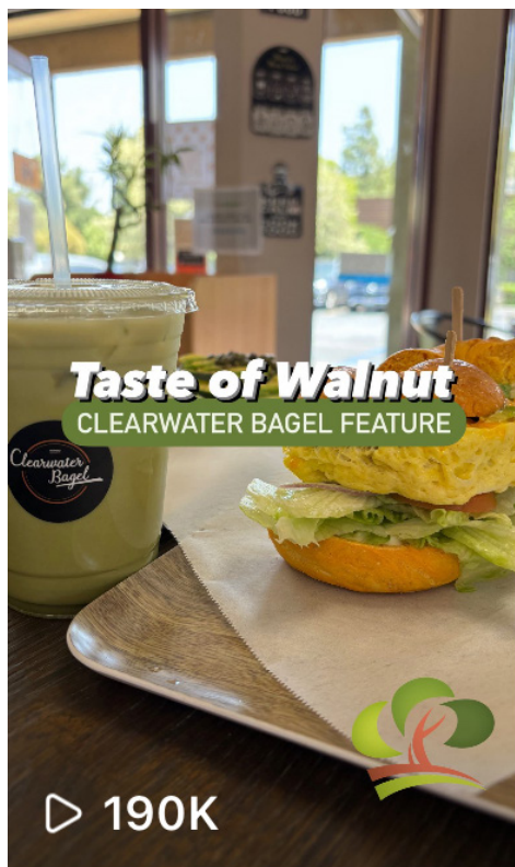
Screenshot from Instagram