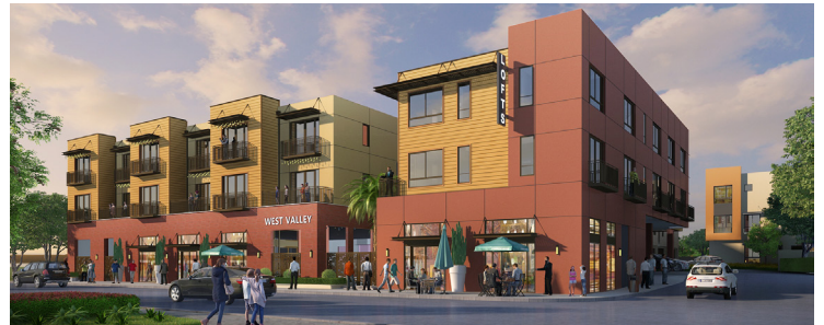
West Valley Lofts Project Rendering

Demolition work of the former Lemon Creek Auto Center at 20225 Valley Blvd has started. This initial work is in preparation for new residential lofts and townhomes. The West Valley Lofts Project will feature 16 townhomes and 17 loft residential units, which are expected to be completed within the next 18 – 24 months. A small commercial component will also be incorporated and is designed as a food/retail space that will be neighborhood serving for the community and surrounding area. The project is located within the West Valley Specific Plan area, which is a long-range plan to revitalize the West Valley corridor with new housing, neighborhood serving commercial/retail/food uses, and public amenities. Several other projects are in various stages of the development process and are expected to begin work within the next year.