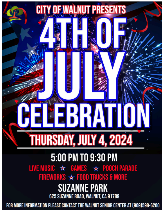
Fourth of July Flyer

The City's 4th of July event will take place at Suzanne Park from 5:00 p.m. to 9:30 p.m. with our firework spectacular launching at approximately 9 p.m. The community is welcome to enjoy live music by Pop Gun Rerun (80's pop/rock band), game booths, food trucks, pooch parade, and much more.