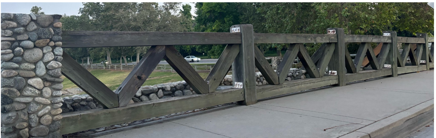
Vehicle Bridge on Snow Creek Drive

The City has awarded a construction contract for the restoration of the vehicle bridge on Snow Creek Drive just east of La Puente Road. This project will focus on replacing the wooden members of the bridge's railings to ensure its longevity and safety and is estimated to be completed by the end of August. While there will be limited impacts to Snow Creek Drive during the project, we are committed to minimizing disruptions. This restoration reflects our City's dedication to maintaining and improving our infrastructure. By prioritizing safety and investing in essential maintenance, we are enhancing the quality of life for all residents.