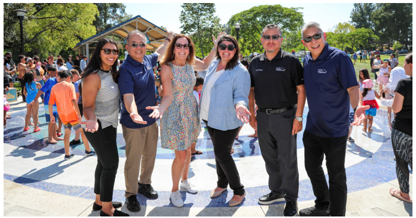
City Staff & City Council at the Diversity Plaza Grand Opening

Staff is thrilled to announce the successful grand opening of the Diversity Plaza Splash Pad at Creekside Park, which officially opened on June 5th. The event was a wonderful celebration, featuring music, games, and giveaways. We are immensely proud of its success and extend our heartfelt thanks to all those who attended and made the day special. We are also excited to announce that the splash pad is now open seven days a week from 10 a.m. to 8 p.m. until the end of October.