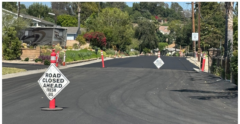
Slurry Seal Project Progress

The City is currently conducting its annual Slurry Seal Project in the Gartel- Fuerte area and the central portion of the City. Please be mindful of and obey the no parking and road closed signs to ensure the safety and efficiency of the work being done. We apologize for any inconvenience this may cause and appreciate your patience as we strive to provide our community with safe, well-maintained streets.