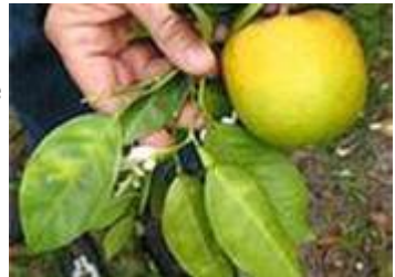
Infected Citrus Tree