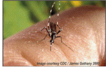
Asian Tiger Mosquito

The San Gabriel Valley Mosquito and Vector Control District continues to caution residents about the risk of West Nile Virus (WNV) in the San Gabriel Valley.