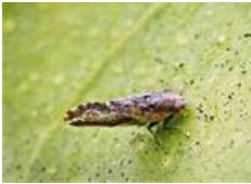
Asian Citrus Psyllid

The citrus tree disease Huanglongbing (HLB), or Citrus Greening, which is spread by the Asian Citrus Psyllid pest, has been detected near in Hacienda Heights. As a result, the California Department of Food and Agriculture has put in place a citrus quarantine zone which